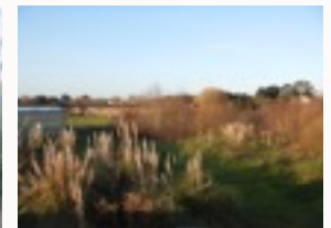
The land ready for the cabins to go on