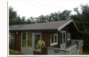
A Keops cabin just like the ones we are building

"The Village Cabins" - 4 log cabins, 3 of them housing 8 students and a member of staff and 1 fully accessible cabin for 4 students and 2 staff.