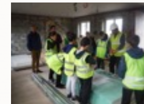
The students regularly visit the site to see what's happening

"The Village Hall" - a building with a classroom/workroom and a commercial type kitchen.