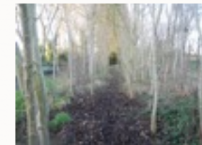
The woodland walk from school to The Village

"The Village Woodland and Wetland" - an area for environmental learning.